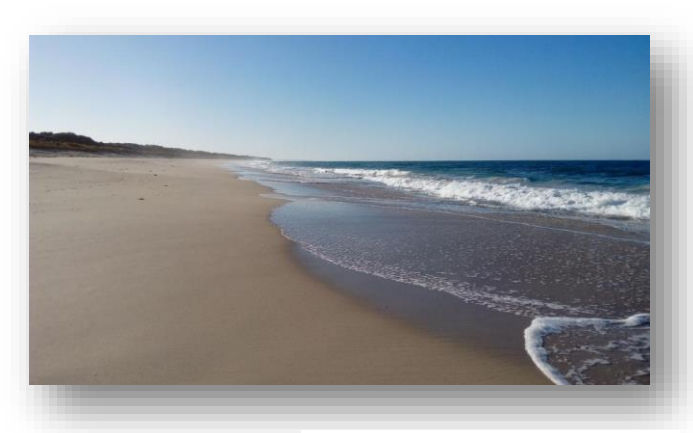
Peace on the beach at Guilderton

Any contributions to and / or feedback on the newsletter would be very much appreciated. I intend to publish a newsletter every quarter, so if you have any news, photos, or new things you've tried in workshops which you would like to share for future publications, please send them to <a href="mailto:selene15@dodo.com.au">selene15@dodo.com.au</a>.